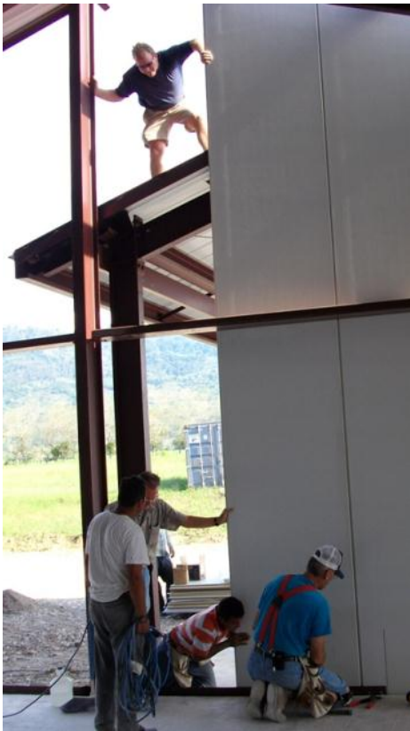
Thank you volunteers!